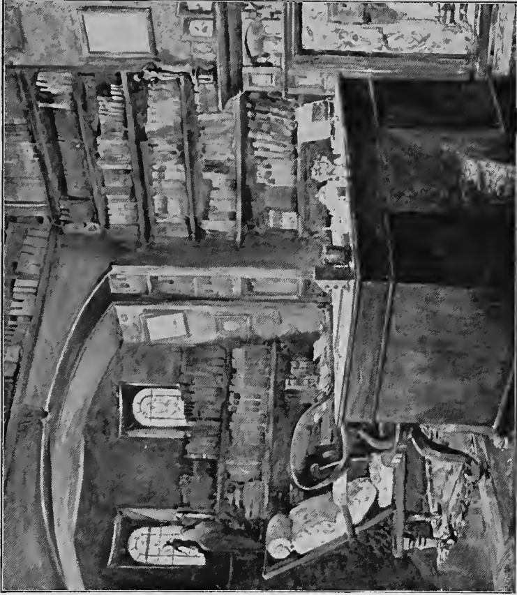
From a Water-Colour by Reginald Barrett.